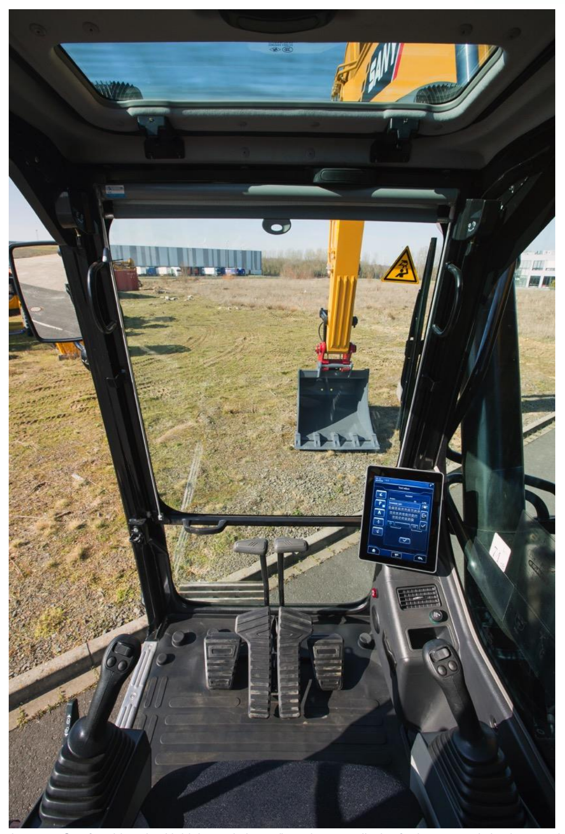
Image 2: Comfortable cab with high-resolution 10" touchscreen display for images and simple operation